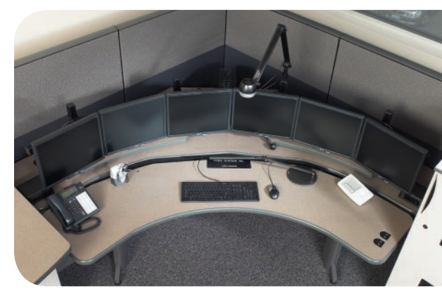
Flexible Worksurface Configuations //////