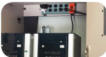
Smart power access ensures quicker maintenance, and less cable clutter around the storage unit.