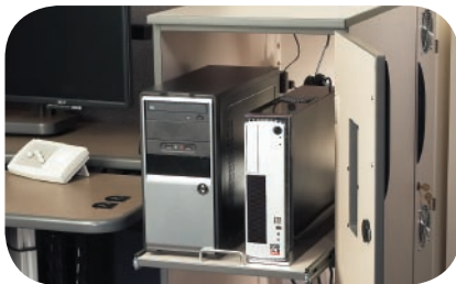
Sliding shelves hold virtually any size CPU.