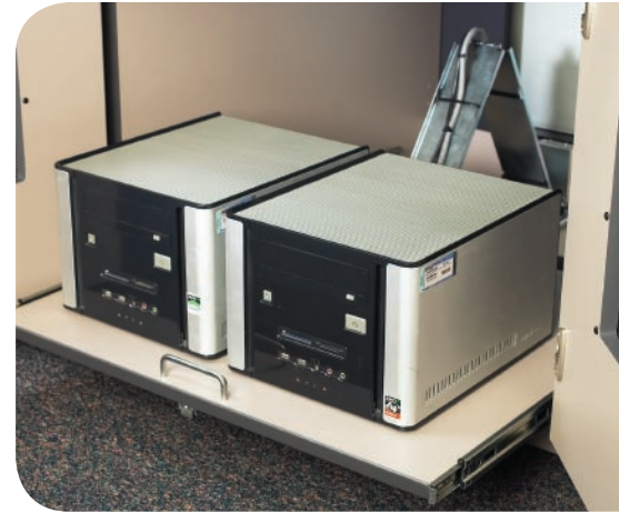
The folding cable arm keeps cabling secure and enables a full range of motion for the shelf.